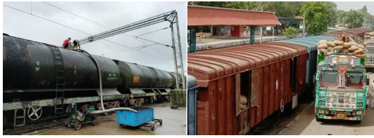
Views of loading of molasses at Bardoli Goods Shed & other commodities in progress over Western Railway.

Ahmedabad, Western Railway's goods & parcel special trains have been continuously traversing across the country to keep the supply of essential commodities moving. In continuation to the consistent marketing efforts made by the Business Development Units (BDUs) of the Divisions have resulted in tapping into attracting new traffic of various types of commodities. In continuation to this, it is worthwhile to mention that the Mumbai Division has recently accomplished transportation of new commodities of Sugar and Molasses. These achievements have been